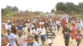
Hundreds of enthusiastic kids after flag off.

Some of the other guest runners were Germany embassy staff, local Fm Radio