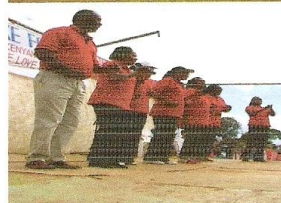
Sponsors stands: - UAP Insurance and Sigona Waters and UAP Insurance staff entertaining the crowd