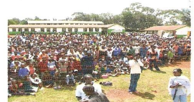
A section of the big crowd at kikuyu township primary school