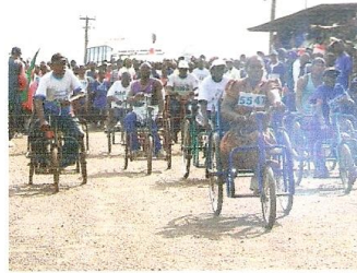
Physically Challenged (wheelchair category) participants.