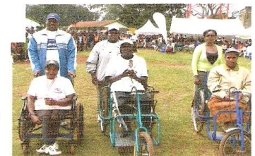
Kilimanjaro water, Rhythms College and Standard Chartered representatives awarding physically challenged category winners. (Women)