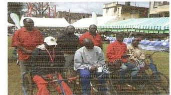
Sigona waters, Baabs Security and UAP Insurance representatives awarding physically challenged category winners. (men)