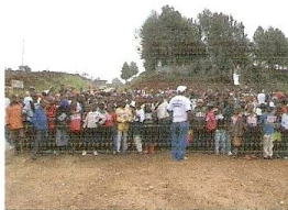
Children at the starting of the run.

presenters, local leaders and administrators. The run was aired live in three leading local Radio Fms Inooro, Kameme and Coro.