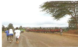
Pupils from Valley Crest Primary school cheering the runners along Wangige Kikuyu Road